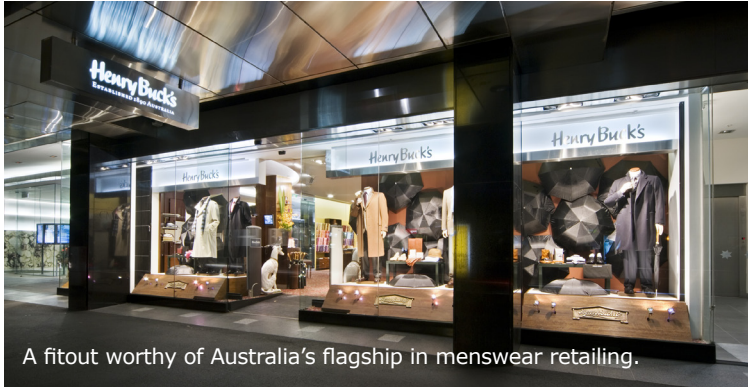
A fitout worthy of Australia's flagship in menswear retailing.